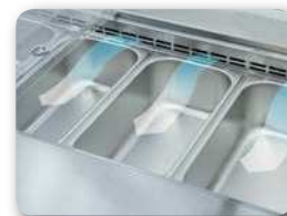
BA – Blown Air Well