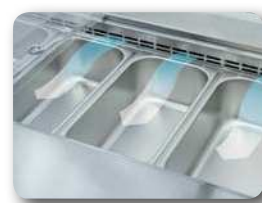
BA – Blown Air Well